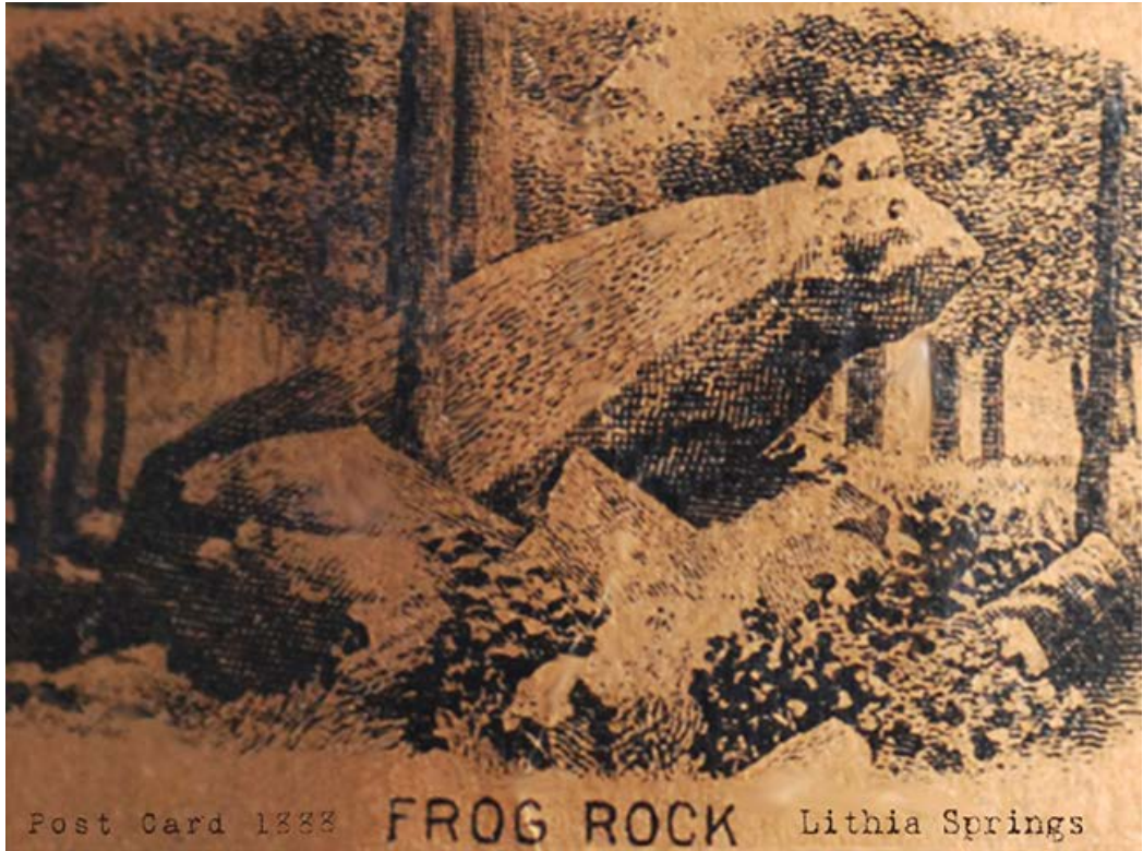
1888 Giant Frog Rock a tourist attraction Lithia Spring GA